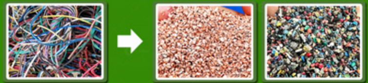
300kg/hr Cable Wire Recycling Machine